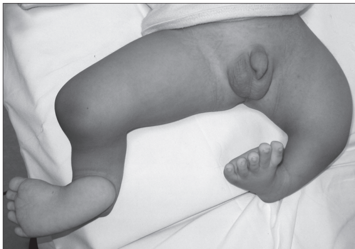
Figure 1. Patient showing shortening of the left thigh and both legs with bilateral varus foot.

The patient's bilateral absence of the tibia with intact fibulae and distally hypoplastic left femur plus normal right femur prompted the diagnosis of bilateral tibial hemimelia types 1a and 1b (Figure 1 and 2); in addition, there were hemivertebrae at T9 and T10 (Figure 3). Over the past forty years, several studies have described over one hundred cases of congenital deficiency of the tibia. 1,3,4,6 Among these patients, five