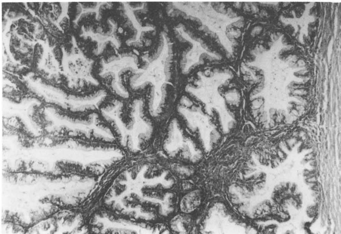
Figure 1a - The epithelium demonstrates multilayering, nuclear abnormalities and increased mitotic activity; (hematoxylin-eosin, X 160)