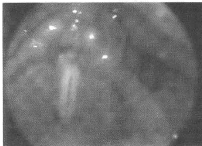
Figure 2 - Larynx rigid telescopy under phonation shows no lesions.

Microscopically, the vocal nodules have varying patterns depending on their evolutionary stage, but the