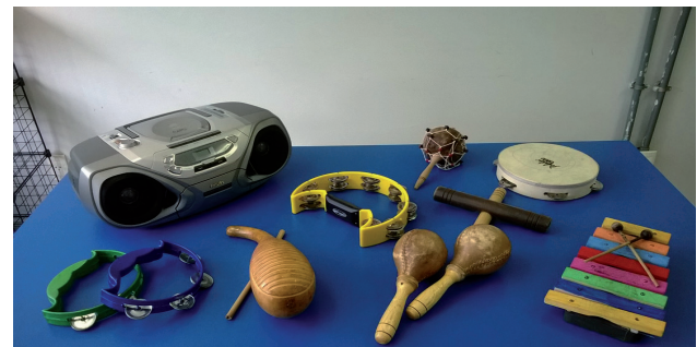
Figure 2 - Stereo, half moon tambourine, guiro (Cuban reco-reco ), maracas , claves , tambourine and xylophone