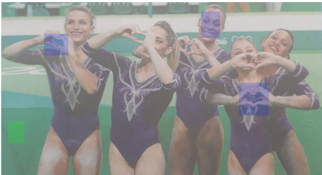
Figure 3 – Athletes celebrating victory, extracted from the report A8.

At the moment after the competitions, the photographs showed signs of joy associated with the victory. In these images, athletes were photographed smiling (Figure 3). In Newspaper A, 14 references were selected, and in Newspaper B there were 20 references.