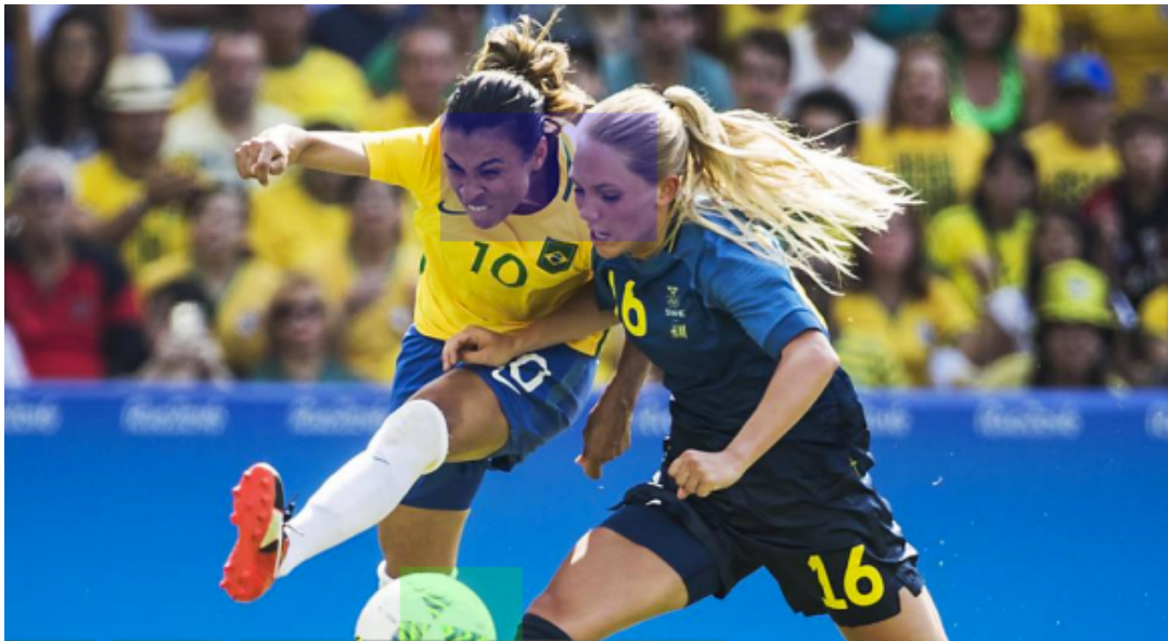
Figure 2 – Athletes disputing ball possession, extracted from the report B46.

At the moment after the competitions, the photographs showed signs of joy associated with the victory. In these images, athletes were photographed smiling (Figure 3). In Newspaper A, 14 references were selected, and in Newspaper B there were 20 references.