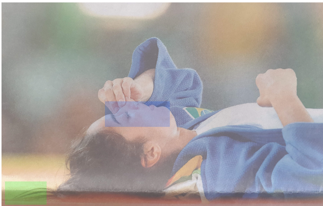
Figure 4 – Athlete crying after defeat, extracted from report A22.

In addition to crying in the texts and in the images, it was found that the writing of the reports tended to highlight the stereotypes of femininity that are related to the fragility of women, as shown in the following excerpts: [...] She has a delicate, almost angelic way and looks younger than her 31 years (A17). At the top of the podium, listening to the Hungarian anthem, she seemed harmless, vulnerable (B23).