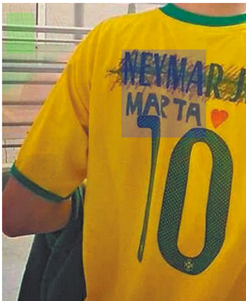
Figure 5 – Fan wearing the Brazilian soccer team jersey, extracted from the report B29.

Women overcoming in relation to men could also be noticed in the training of athletes. The physical preparation that gave them the appearance and performance equivalent to the masculine one was highlighted in a positive way, according to the following excerpt: The new phase made her sprout stronger, almost masculinized, but mortal (B15).