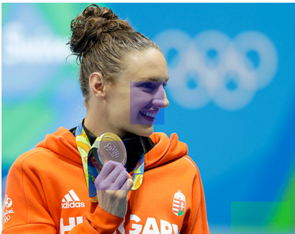
Figure 1 – Athlete holding medal, extracted from report B2.

In the images selected, it was possible to observe emphasis on the achievement of medals, as 11 photographs were recorded on the podium. It was observed that athletes themselves emphasized their victories by showing the medals at the moment of photography, usually supported on one hand and away from the body (Figure 1).