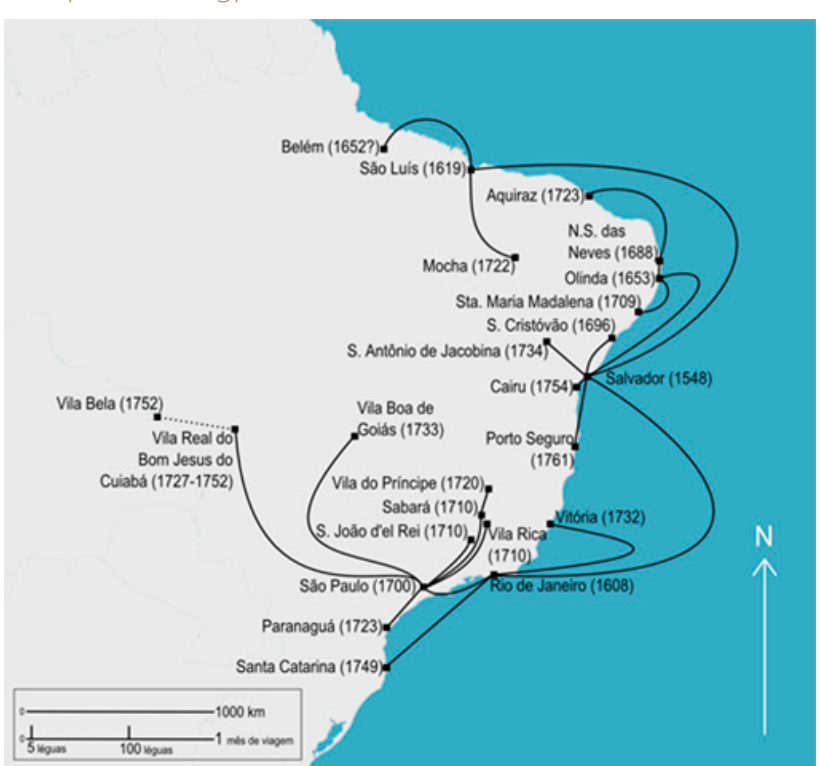
Map 2. Chronology of the creation of comarcas—16th-18th centuries

even broader spatial implication, with significant repercussions in the countryside in the north and northeast, as has been shown in various recent studies (Mello, 2012; Atallah, 2010; Sousa, 2012; Jesus, 2006).