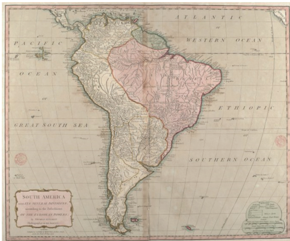
Map 2. Western boundary of Portuguese America over Spanish domain. 9

of Chiquitos, disabled the Spanish dealers, since they did not know up to which point the Portuguese were inside Mato Grosso. 48