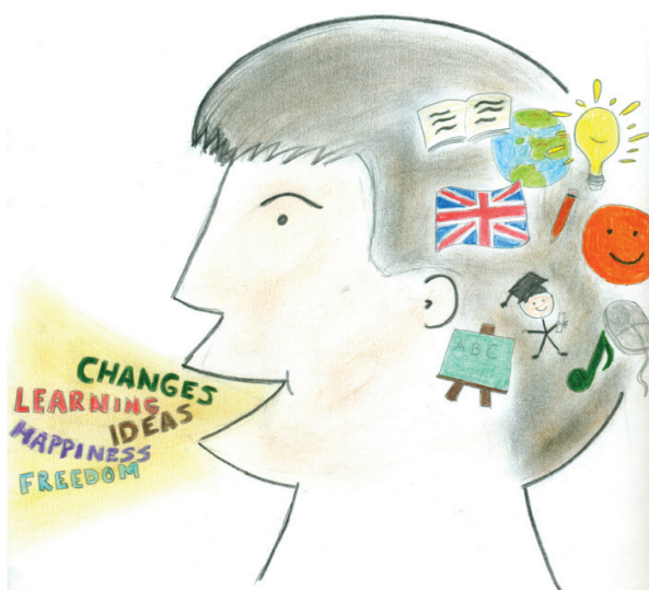
Fig. 3. Visual Metaphor 3, Learner 3 (VM3, L3)

In terms of Oxford et al.'s (1998) model the educational perspective this learner represents is Learner-Centered Growth as the input she receives seems to facilitate the development of her potentialities. This cognitive dimension is illustrated by the focus on the learner's head and references to the various linguistic inputs that constitute the language learning process. Some of these such as the teacher, the book and the whiteboard represent formal education; others (flag and world) depict cultural aspirations. Simultaneously, language learning is also portrayed as output in the form of concepts that, as supported by the narrative, have been internalised: