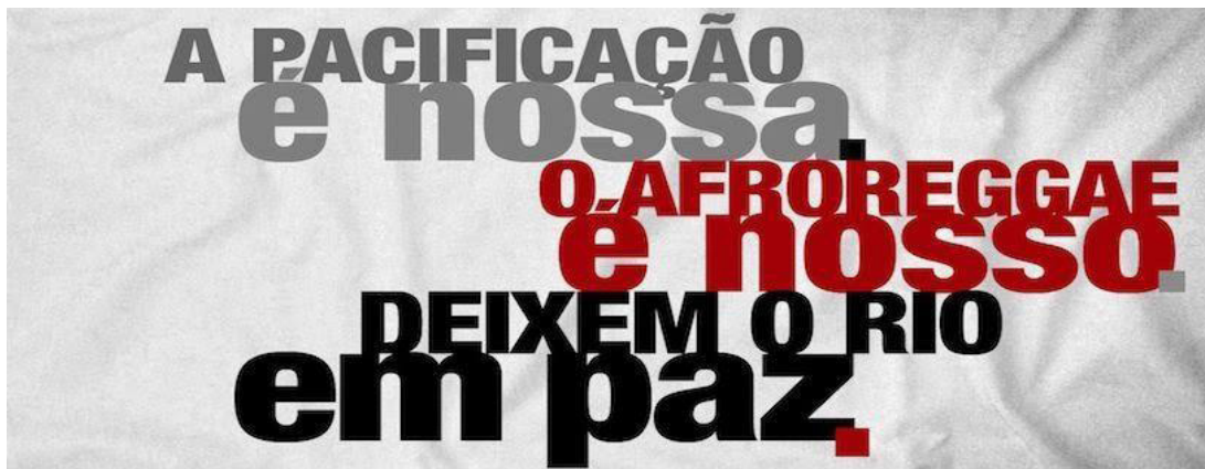
Pacification is ours. Afroreggae is ours. Leave Rio in Peace.

The fear of the dissolution of the police pacification units reached not only residents of the “pacified” favelas, but also artists, business people, athletes, professionals and social entities that had publically defended the project in the second half of 2013. A group of city residents decided to create a “protection network” for the pacification units as indicated in the article in the O Globo newspaper of August 24, 2013. They launched the “Leave Rio at Peace” movement, which arouse as a reaction to the “traffickers attacks” on the offices of AfroReggae in the Complexo do Alemão in late July.