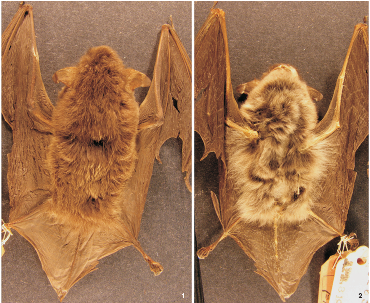
Figure 1. Dorsal and ventral views of the skin of the holotype of Myotis punensis (AMNH 36263). Forearm length 31.6 mm. The electronic version of this article includes this figure in color.

cranial and external morphology, BOGAN (1978) refuted the distinctness of those samples in relation to other South American samples of M. nigricans . Based on BOGAN'S (1978) results other specimens assigned to M. n. punensis by LAVAL (1973) probably are M. nigricans . Despite the conclusions of LAVAL (1973) and BOGAN (1978), if those populations on the west side of the Andes ultimately should prove to be distinct from populations assigned to M. nigricans nigricans by LAVAL (1973), as well as from other currently recognized South American species, the name Myotis punensis J.A. Allen, 1914, is not available for them, as it is a junior synonym of Myotis albescens (É. Geoffroy, 1806). A possible name for those populations is Myotis esmeraldae J.A. Allen, 1914, a name currently in the synonymy of Myotis nigricans .