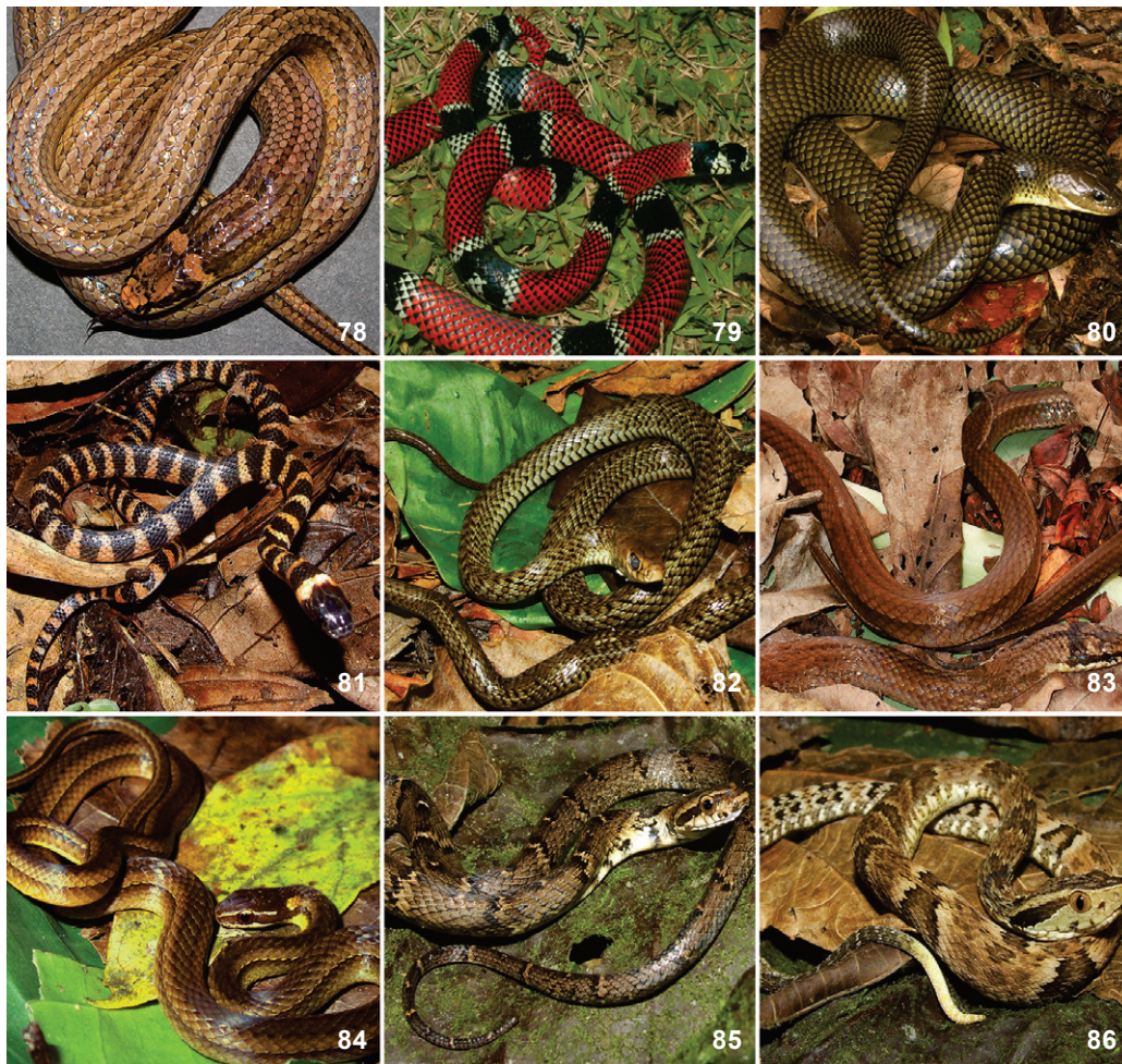
Figures 78-86. Reptile species sampled for the Parque Natural Municipal Nascentes de Paranapiacaba, Santo André, São Paulo state: (78) Elapomorphus quinquelineatus ; (79) Erythrolamprus aesculapii ; (80) Erythrolamprus miliaris ; (81) Oxyrhopus clathratus ; (82) Philodryas patagoniensis ; (83) Taeniophallus affinis ; (84). Taeniophallus bilineatus ; (85) Xenodon newwiedii ; (86) Bothrops jararaca .

larger male size (CRC: 30.3 mm) (Clarissa Canedo pers. com.). However, only a more representative sampling of the population and a broader taxonomic revision including the large complex under the name of I. guentheri , will provide sufficient grounds to diagnose this new species.