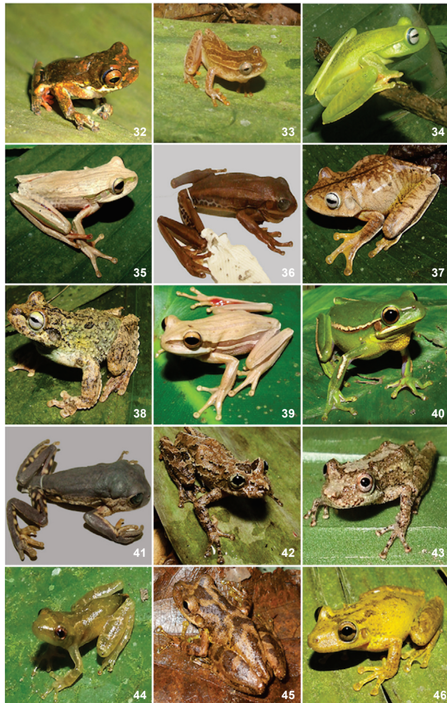
Figures 32-46. Anuran species sampled for the Parque Natural Municipal Nascentes de Paranapiacaba, Santo André, São Paulo state: (32) Dendropsophus microps ; (33) Dendropsophus minutus ; (34) Hypsiboas albomarginatus ; (35) Hypsiboas bischoffi ; (36) Hypsiboas cymbalum (MZUSP 74194); (37) Hypsiboas faber ; (38) Hypsiboas pardalis ; (39) Hypsiboas bandeirantes ; (40) Hypsiboas prasinus ; (41) Phyllomedusa rohdei (MZSUP 81306); (42) Scinax brieni ; (43) Scinax cf. perpusillus ; (44) Scinax crospedospilus ; (45) Scinax fuscovarius ; (46) Scinax hayii .