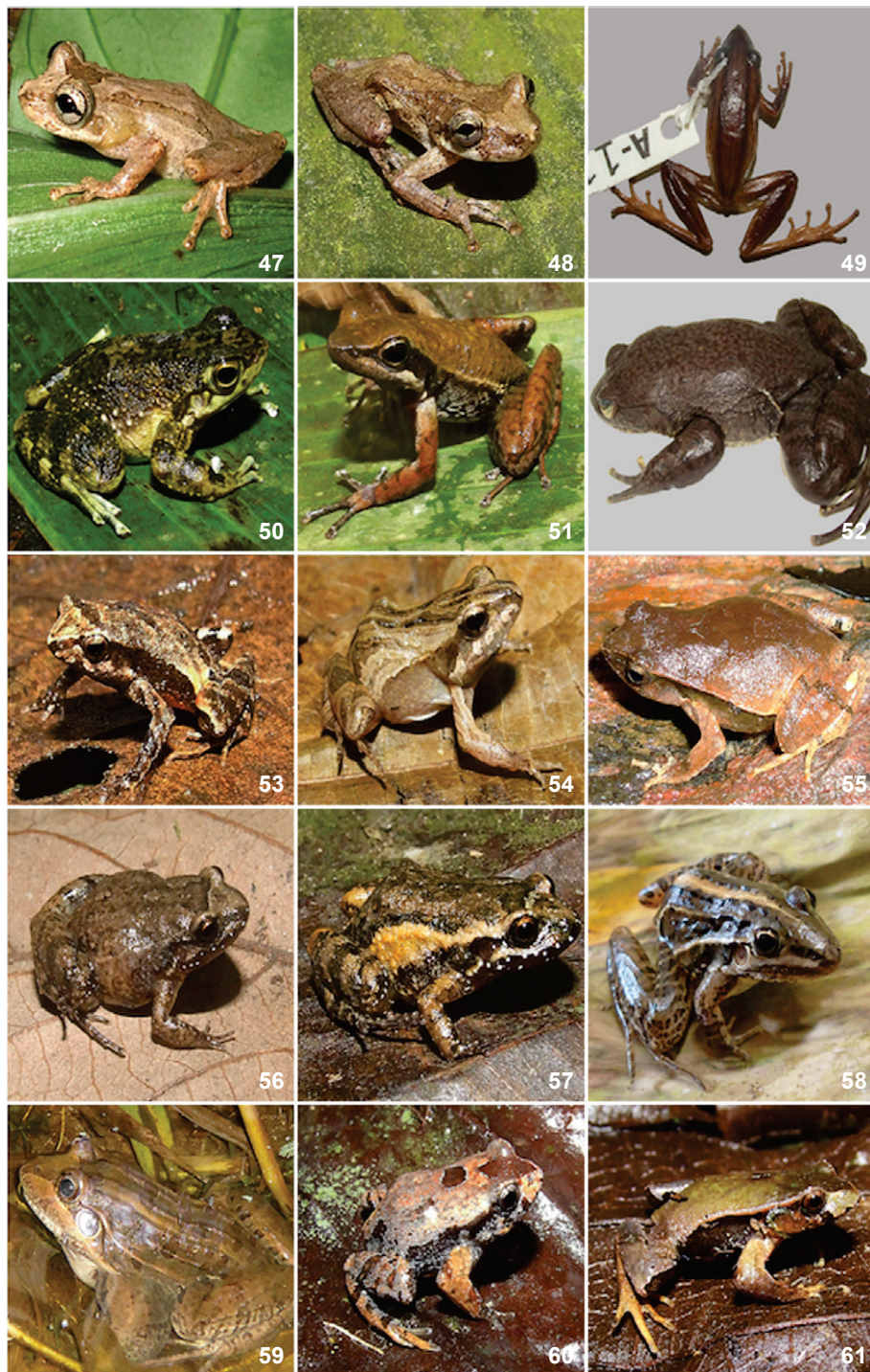
Figures 47-61. Anuran species sampled for the Parque Natural Municipal Nascentes de Paranapiacaba, Santo André, São Paulo state: (47) Scinax hiemalis ; (48) Scinax rizibilis ; (49) Scinax squalirostris (MZUSP 113525); (50) Hylodes asper ; (51) Hylodes sp. (aff. phylloides ); (52) Megaelosia massarti (ZUEC 8516); (53) Physalaemus bokermanni ; (54) Physalaemus cuvieri ; (55) Physalaemus moreirae ; (56) Leptodactylus ajurauna ; (57) Leptodactylus cf. marmoratus ; (58) Leptodactylus jolyi ; (59) Leptodactylus latrans ; (60) Paratelmatobius cardosoi ; (61) Paratelmatobius poecilogaster .