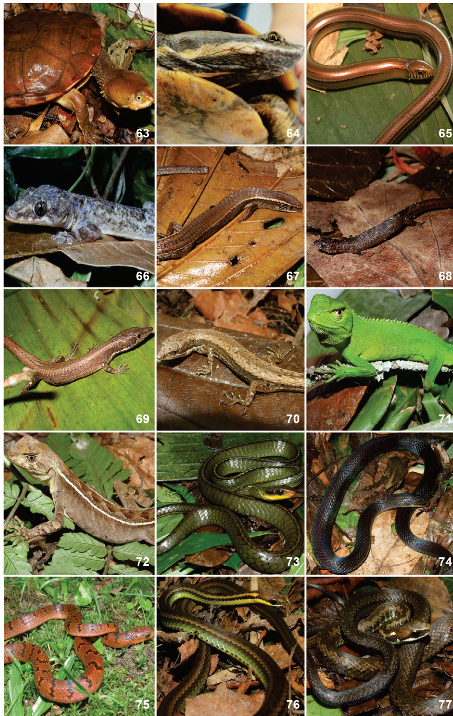
Figures 63-77. Reptile species sampled for the Parque Natural Municipal Nascentes de Paranapiacaba, Santo André, São Paulo state: (63) Hydromedusa maximiliani ; (64) Hydromedusa tectifera ; (65) Ophiodes cf. fragilis ; (66) Hemidactylus mabouia ; (67) Colobodactylus taunayi ; (68) Ecpleopus gaudichaudii ; (69) Placosoma cordylinum champsonotus ; (70) Placosoma glabellum ; (71) Enyalius iheringii ; (72) Enyalius perditus ; (73) Chironius bicarinatus ; (74) Atractus serranus ; (75) Atractus zebrinus ; (76) Echinanthera cephalostriata ; (77) Echinanthera undulata .