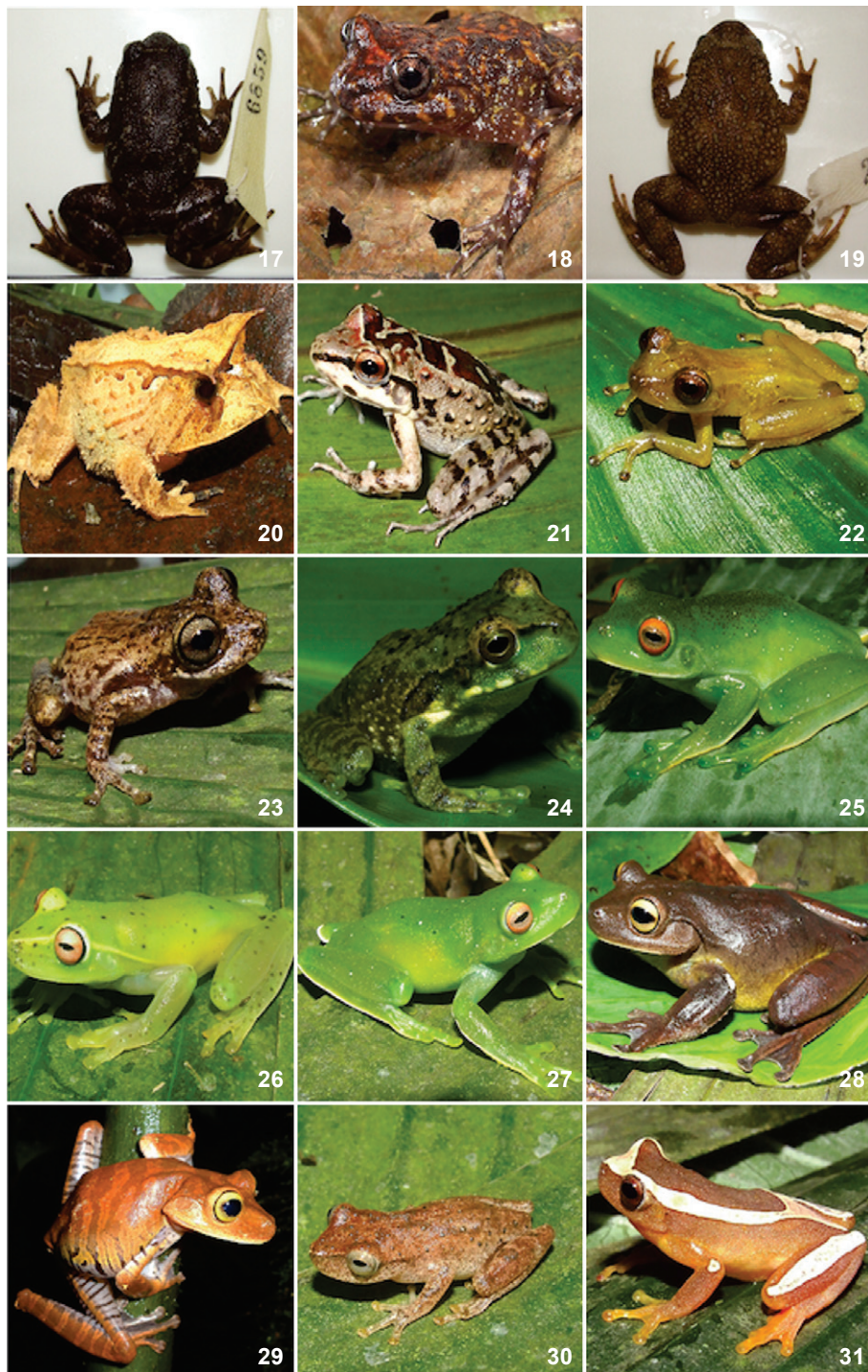
Figures 18-31. Anuran species sampled for the Parque Natural Municipal Nascentes de Paranapiacaba, Santo André, São Paulo state: (18) Cycloramphus eleutherodactylus ; (19) Cycloramphus semipalmatus (ZUEC 2722); (20) Proceratophrys melanopogon ; (21) Thoropa taophora ; (22) Fritziana fissilis ; (23) Fritziana ohausi ; (24) Gastrotheca fulvorufa ; (25) Aplastodiscus albosignatus ; (26) Aplastodiscus arildae ; (27) Aplastodiscus leucopygius ; (28) Bokermannohyla circumdata ; (29) Bokermannohyla hylax ; (30) Dendropsophus berthaltutzae ; (31) Dendropsophus elegans .