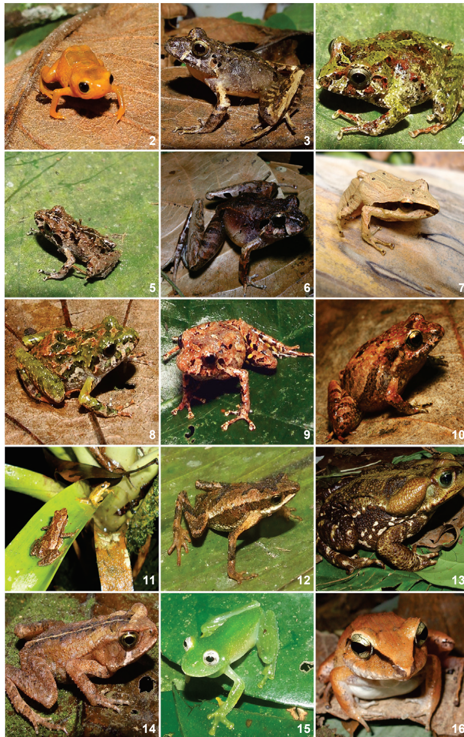
Figures 2-16. Anuran species sampled for the Parque Natural Municipal Nascentes de Paranapiacaba, Santo André, São Paulo state: (2) Brachycephalus sp.; (3) Ischnocnema sp. (aff. guentheri ); (4) Ischnocnema sp. ( lactea series); (5) Ischnocnema cf. spanios ; (6) Ischnocnema guentheri ; (7) Ischnocnema hoehnei ; (8) Ischnocnema juipoca ; (9) Ischnocnema nigriventris (10) Ischnocnema parva ; (11) Dendrophryniscus brevipollicatus ; (12) Dendrophryniscus cf. brevipollicatus ; (13) Rhinella icterica ; (14) Rhinella ornata ; (15) Vitreorana uranoscopa ; (16) Haddadus binotatus ; (17) Cycloramphus dubius (ZUEC 6859).