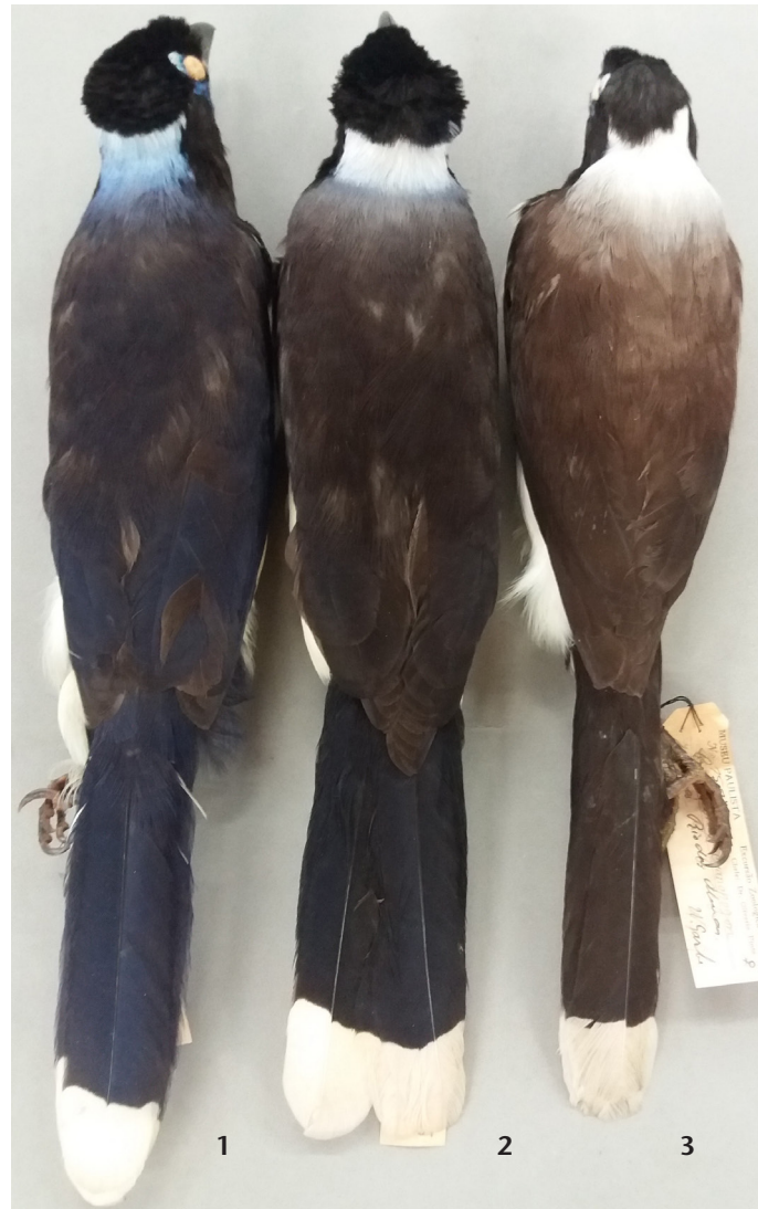
Figures 1–3. Hybrid MZUSP 64191 (2) between C. c. chrysops MZUSP 26041 (1) and C. cyanopogon MZUSP 27910 (3). Back and wings are brownish, resembling C. cyanopogon . The crest feathers have the typical C. c. chrysops shape, but nape coloration is lighter, almost completely white like C. cyanopogon .