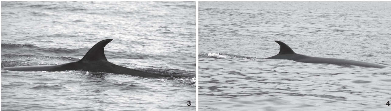
Figures 3-4. Nicks and notches on Bryde's whale dorsal fin. Pictures are from the same individual (RJB002 – ArCaB004). Copacabana Beach, Rio de Janeiro (3) and Cabo Frio region on February 2014 (4).

the snubnose anchovy, Anchoviella brevirostris (Günther, 1868) (N = 4); the white snake mackerel, Thyrstlops lepidopoides (Cuvier, 1832) (N = 1); and a mixed school of Brazilian sardines, Sardinella brasiliensis (Steindachner, 1879) and mullet (Mugilidae) or mojarra (Gerreidae) (N = 1).