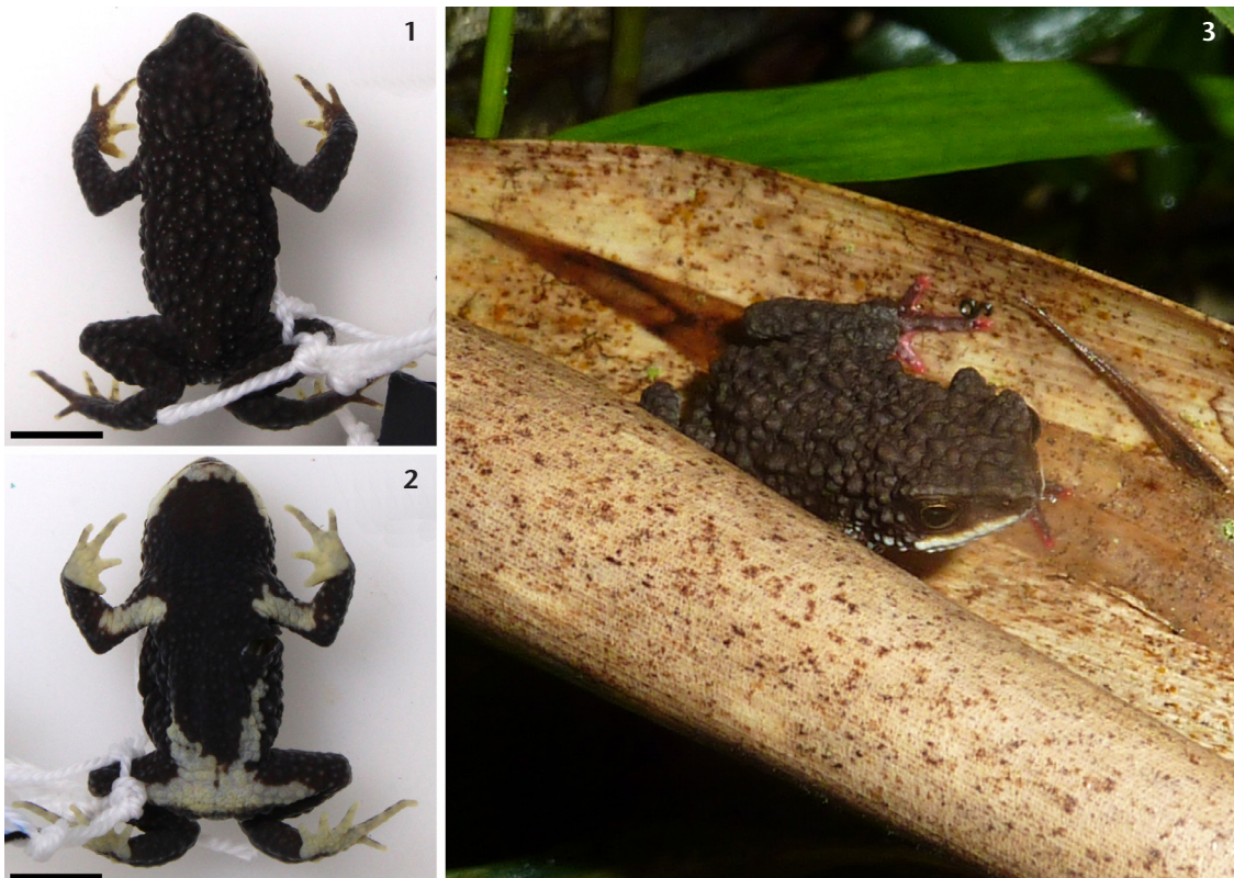
Figures 1–3. Specimens of Melanophryniscus xanthostomus : dorsal view (1) and ventral view (2) from FURB 22851 specimen and FURB 22713 specimen in life (3).

We analyzed calls in RAVEN PRO 1.5 for Mac (Bioacoustics Research Program 2012) and constructed audio spectrograms in R using the package seewave (Sueur et al. 2008) with the following parameters: FFT window width = 256, Frame = 100, Overlap = 75, and flat top filter. We analyzed acoustic parameters normally used for species of Melanophryniscus : dominant frequency (Hz), call duration (sec), call interval (sec), first segment duration (sec), second segment duration (sec), interval between first and second segment (sec), number of short notes, duration of short notes (sec), interval between short notes (sec), note rate of the first segment (the ratio of the absolute number of notes and the absolute duration of the segment), pulse number of the second segment, and pulse rate of the second segment (the ratio of the absolute number of pulses and the absolute duration of the segment). Terminology of call descriptions follows Köhler et al. (2017).