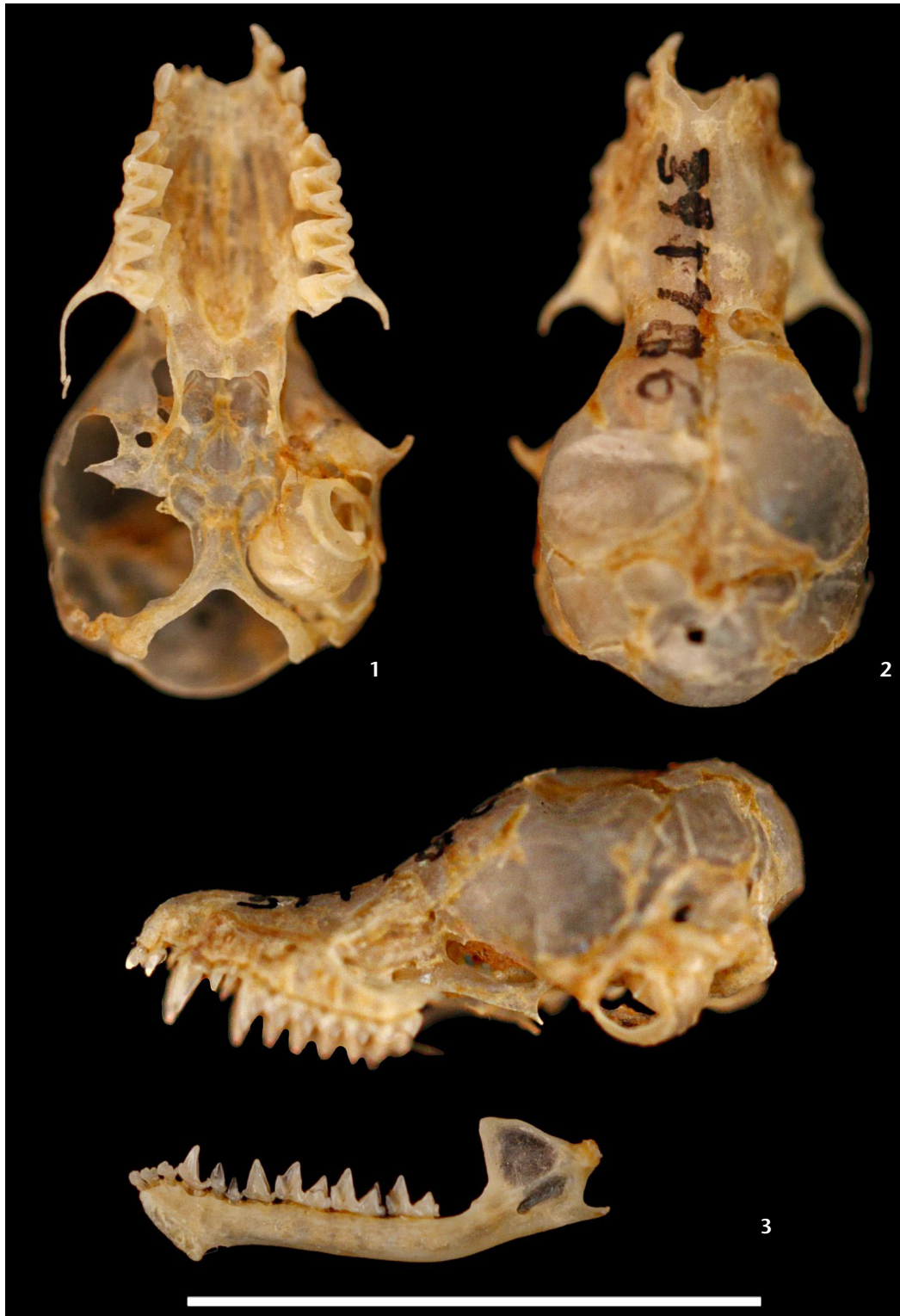
Figures 1–3. Ventral (1), dorsal (2), and lateral (3) views of the skull, and lateral view of the mandible of the neotype of Myotis atacamensis (USNM 391786) from Atacama Desert, Tarapacá, Chile. Scale bar = 10 mm.