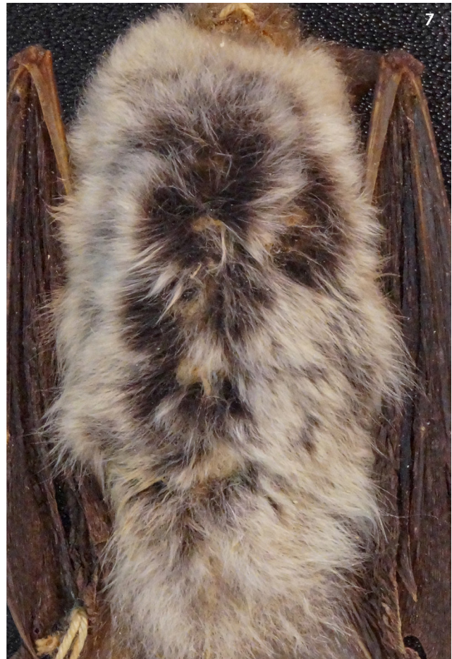
Figures 6–7. Details of tricolored dorsal fur (6) and bicolored ventral fur (7) of Myotis atacamensis (MVZ 116638).