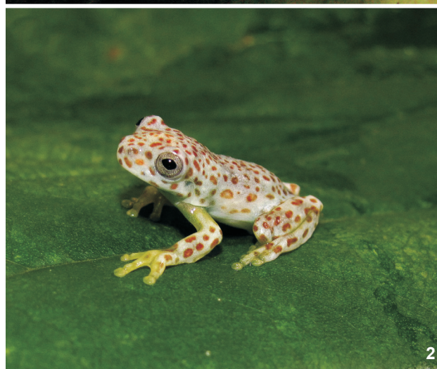
Figures 1-2. (1) Tadpoles of H. pardalis living inside a leaf-tank of a bromeliad at Serra do Brigadeiro State Park, municipality of Araponga, state of Minas Gerais, Brazil. (2) A froglet of H. pardalis , from a tadpole which metamorphosed 50 days after being collected (MZUFV 167).

cause it has been considered a fixed behavior (TOUCHON & WARKENTIN 2008). For example, species that construct basins in which eggs are laid (mode 4), essentially do not differ in any way in their egg and larval development from many anurans with mode 1. Consequently, they sometimes will place eggs in natural rock pools or streams (WELLS 2007). This was already verified for the nest-building gladiator frog H. faber by HADDAD & PRADO (2005). According to these authors, when the water level rises so that muddy banks are not available for males to construct their nests (mode 4), the eggs are deposited as a surface film in ponds (mode 1). A similar plasticity in the reproductive