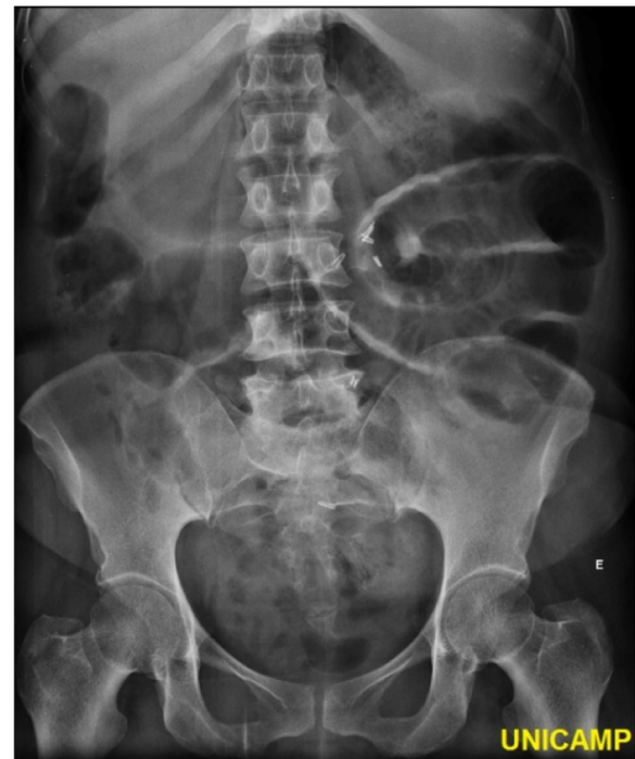
Fig. 2 – Simple abdominal radiograph showing dilated loops of the small intestine (jejunum) with visible convex valves, located mainly in the upper left quadrant.

On the 1st postoperative, the patient walked without help and accepted oral liquid diet. On the 3rd postoperative after accepting mild diet and eliminate gases and received hospital discharge. On 5th postoperative day, she returned to the hospital emergency room, complaining about severe abdominal colic, accompanied by vomiting, stopping the gas and stool elimination. Physical examination showed no fever, but she was tachycardiac and dehydrated. The abdomen was painful to palpation, distended, but without signs of peritoneal irritation. With suspicion of intestinal obstruction, a radiographic series of the abdomen was performed, which showed suggestive signs of intestinal obstruction: dilated small intestine loops with visible convex valves, grouped mainly in the upper