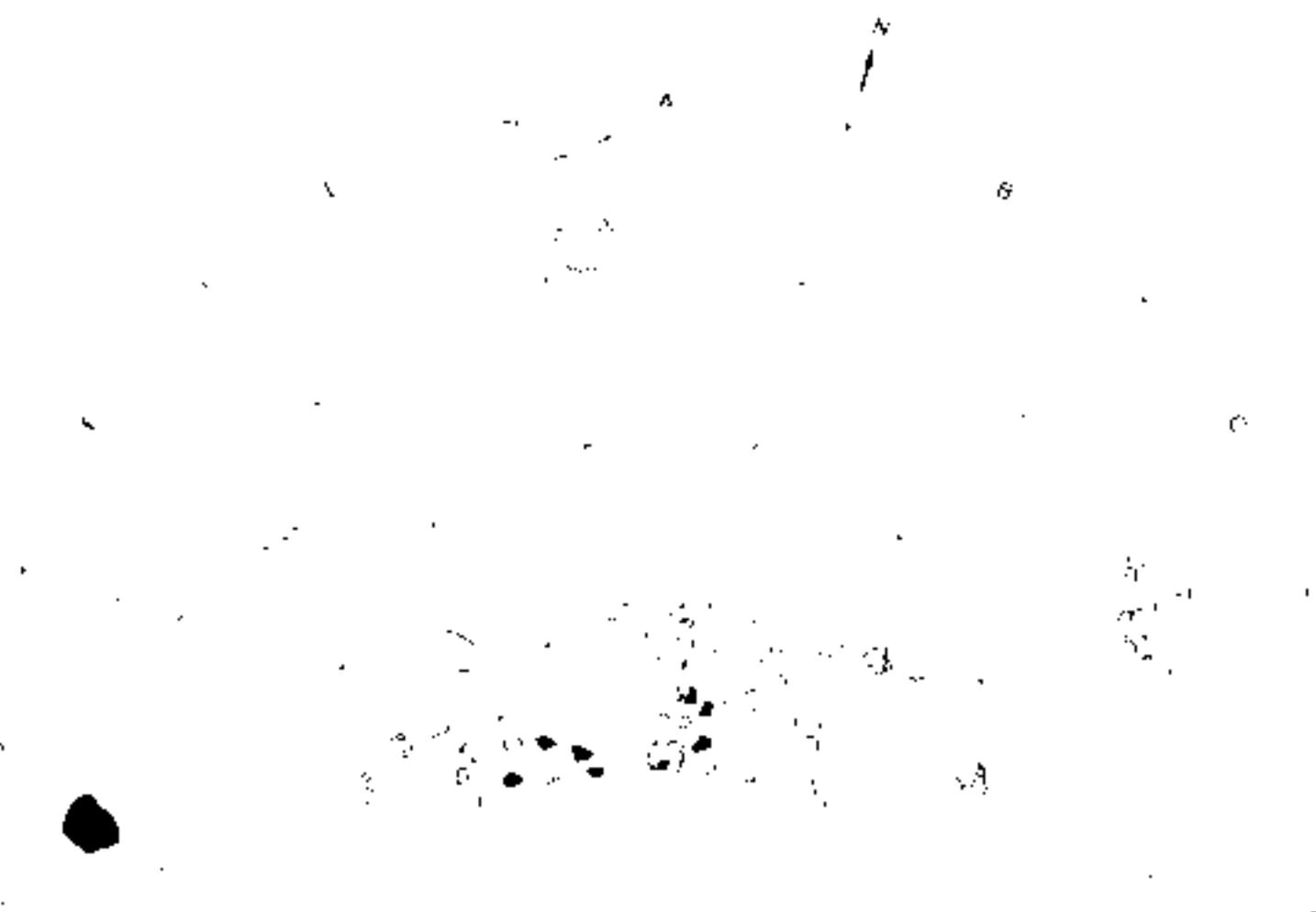
Fig. 2: scheme of sampling sectors at "Las Piedras", wild natural environment. Natural stone grounds are drawn: white infested; black non infested.