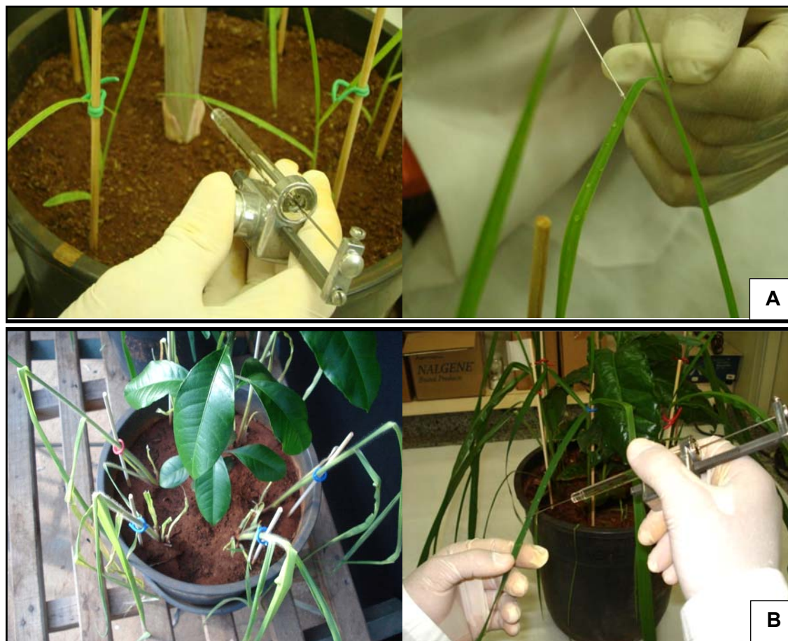
Figure 1 - Application of ^{14}\text{C} -glyphosate in Urochloa brizantha leaves using a Hamilton microsyringe and a PB600-1 repetitive dispenser, and distribution of sugarcane (A) and citrus (B) seedlings.

of the other crops, in addition to the sugarcane stem, were carefully separated with the help of scissors; when necessary, running water was used to remove the excess of soil on the roots; then they were placed on a tray to dry at room air.