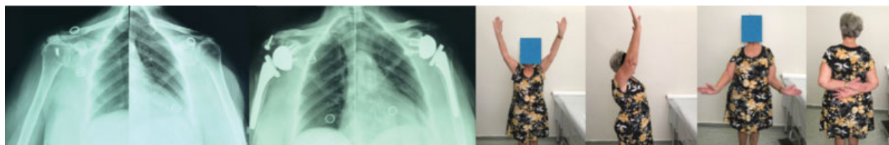
Fig. 1 Case of a 72-year-old woman with bilateral reverse prosthesis.

and 2 (8%) as 2B. The patients were assessed using the Disabilities of the Arm, Shoulder and Hand (DASH) score, the Short-Form (36) Health Survey (SF-36), the visual analogue scale (VAS) of pain rating, and the University of California – Los Angeles (UCLA) score. The average age at the time of the surgery was 66 years old (range: 55 to 83 years old). The duration of symptoms prior to the surgery was ~ 2.5 years (range: 12 months to 6 years). The mean follow-up was of 42.4 months (range: 19 to 56.7 months).