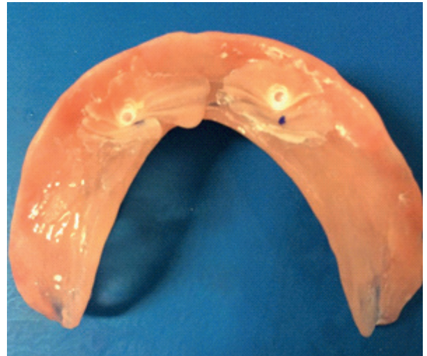
Figure 3. Teflon capsules captured.

The conventional capsules were removed with a frusto-conical cutter (figure 1) and the Teflon® capsules (Fig. 2 and 3) were fixed with autopolymerizable acrylic resin (Clássico, Campo Limpo Paulista, SP, Brazil). After polymerization was performed the finished, polished (Fig. 4), and installed the prostheses (Fig. 5). Soft tissues