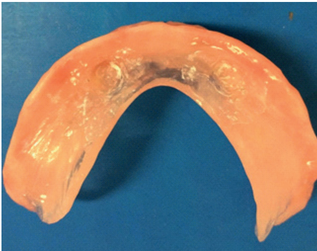
Figure 1. Overdenture prepared for capture of capsules.

After installation of the new prostheses, the patient returned to the clinic complaining of lack of retention of the inferior overdenture. Clinical examination revealed O-ring wear, instability of the prosthesis, and difficulty with insertion. Then was suggested to replace the conventional capsule with O-ring with an alternative model, made of polymeric material, Teflon®, with dimensions of Ø 4 x 3 mm.