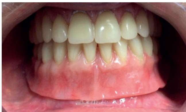
Figure 5. Installed overdenture prostheses.

conditions, mandibular overdenture adaptation and retention showed satisfactory results clinically analyzed and reported by the patient during the 6-months follow up.