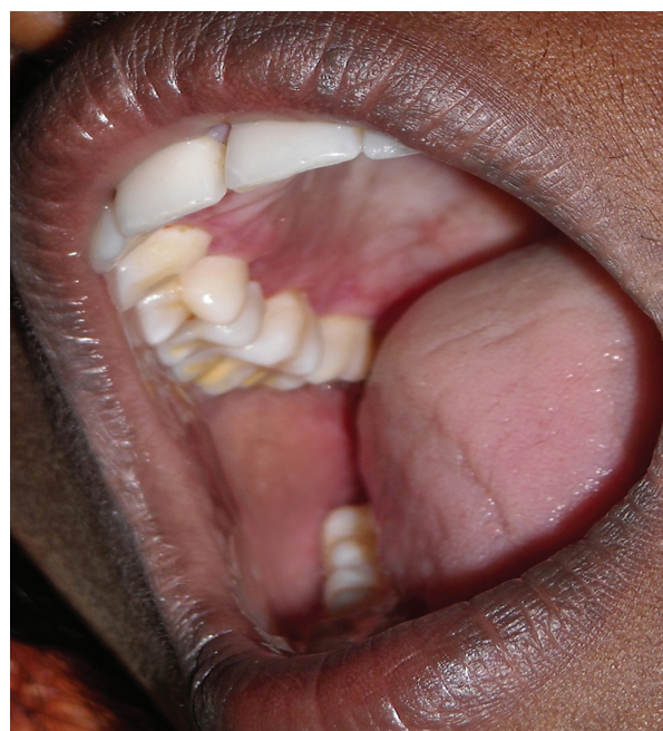
Fig. 3. Post-treatment photograph showing the healed lesions and normal aspect of the gingival and oral mucosa.