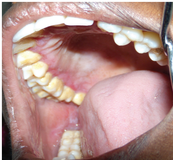
Fig. 1. Initial photograph showing the desquamative lesion in the maxillary palatal gingiva and retromolar mucosa.

A 23 year-old female patient was reported to the Department of Periodontics of the Saveetha Dental College and Hospitals at Chennai, India, with the chief complaint of erosive gums and burning sensation of oral mucosa for the previous two years. The intraoral examination revealed erosive ulcerative lesions that were limited to the attached gingiva of the maxillary palatal region and the retromandibular region with a classic desquamative pattern seen in MMP.