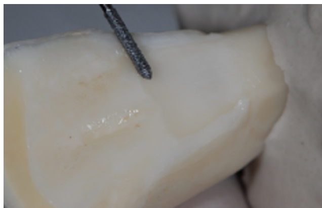
Fig. 2. Preparation of the cingulum region with a rotary diamond tip.