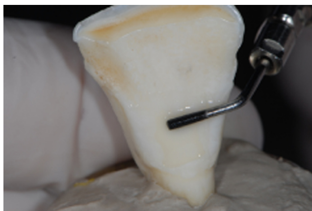
Fig. 3. Preparation of the cingulum region with a CVD tip.