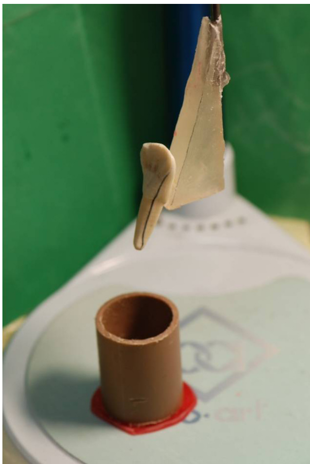
Fig. 1. Setting of a bovine tooth with the help of matrix lined with standardized angles.