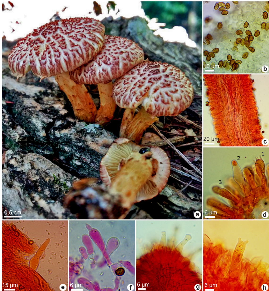
Figure 3 – a-h. Gymnopilus luteofolius – a. basidiomata; b. basidiospores; c. hymenophoral trama; d1. basidium; d2. pleurocystidium; d3. basidiole; e. pileocystidium; f. pleurocystidium with rostrate apex; g. cheilocystidia; h. basidia. (leg. M. Campi 128).

≡ Agaricus luteofolius Peck, Annual Report on the New York State Museum of Natural History 27: 94 (1875).