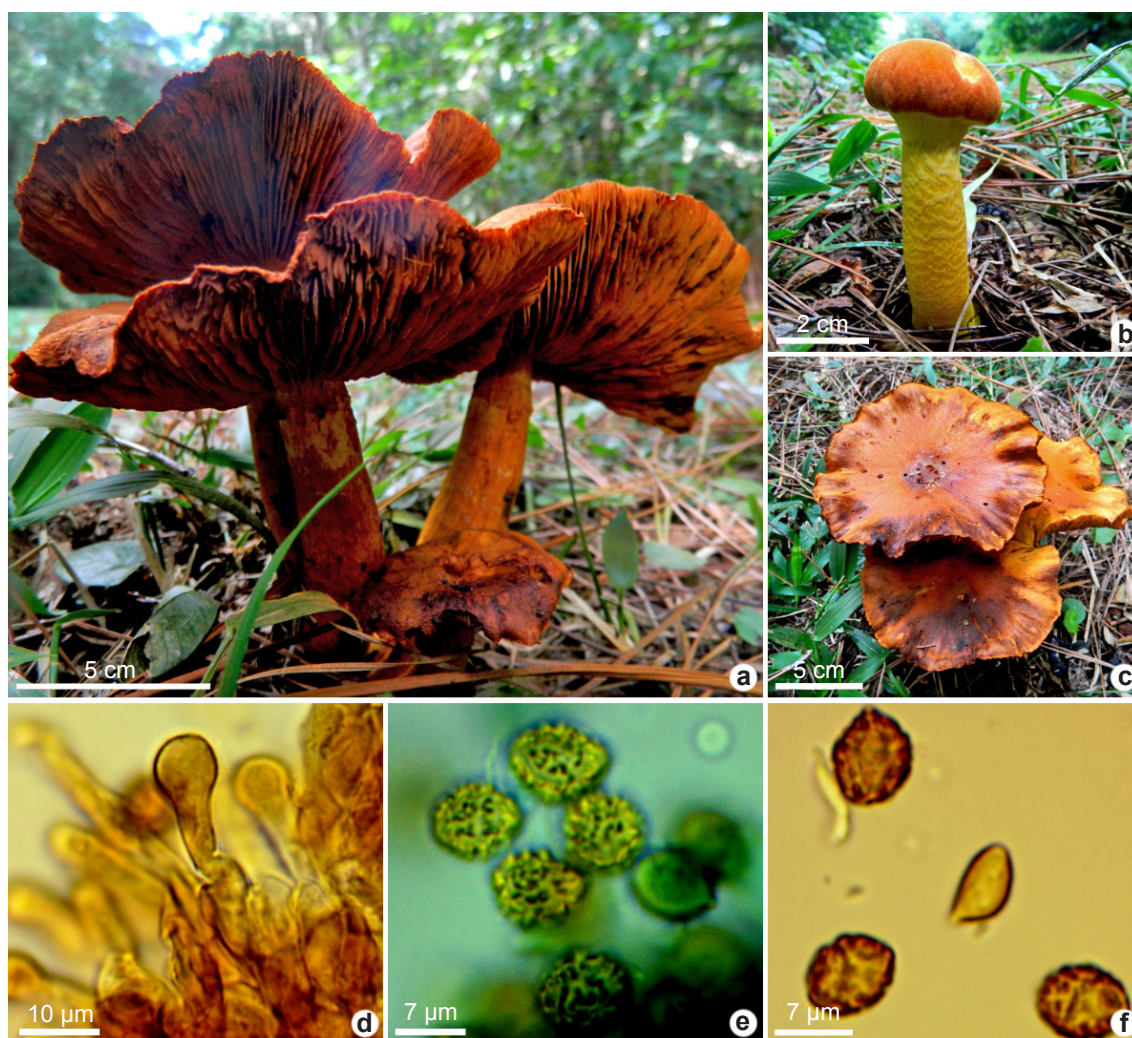
Figure 1 – a-f. Gymnopilus imperialis – a, b, c. basidiomata when fresh (b. immature basidioma); d. cheilocystidia; e. basidiospores in cotton blue; f. basidiospores in KOH. (leg. M. Campi 027).

It was found in grassland near plantations of Pinus elliotti , during autumn.