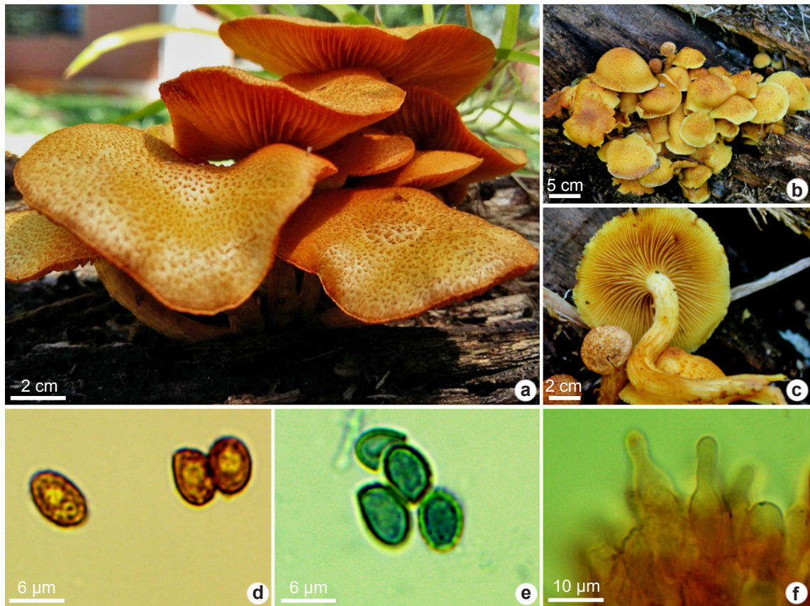
Figure 5 – a-f. Gymnopilus purpureosquamulosus – a, b, c. basidiomata (c. pileus showing lamellae); d. basidiospores in KOH; e. basidiospores in cotton blue; f. cheilocystidia. (leg. M. Campi 121).

There is some confusion between G. purpureosquamulosus and G. chrysopellus Singer & Digilio (1951). Gymnopilus chrysopellus was described by Berkeley & Curtis (1869) as Agaricus (Flammula) chrysopellus from Cuba. These authors