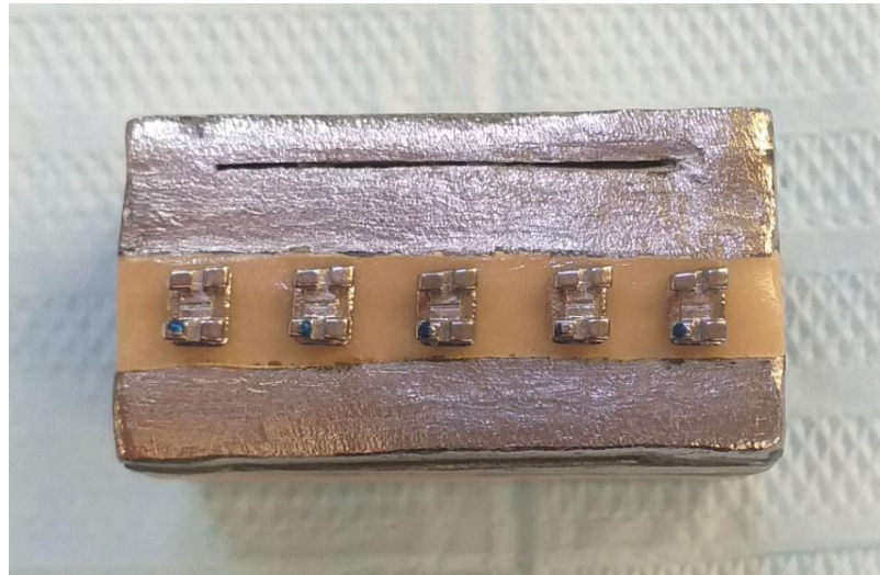
Figure 1. Specimen obtained for positioning the supports for the tensile test.

The prepared specimens were stored in deionized water at 37°C for 24 hours 8,15 . The shear bond strength test was performed with a Universal Test machine INSTRON 4411 (Instron Corp, USA) with a chisel adapted for stabilization, and the speed used was 1mm/min. (Figure 2).